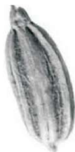
Figure : Dried Ripe Fruit of Fennel

It is a five-sided fruit with green to yellowish brown colour and sweet aromatic odour and taste. Fruits are glabrous and straight.